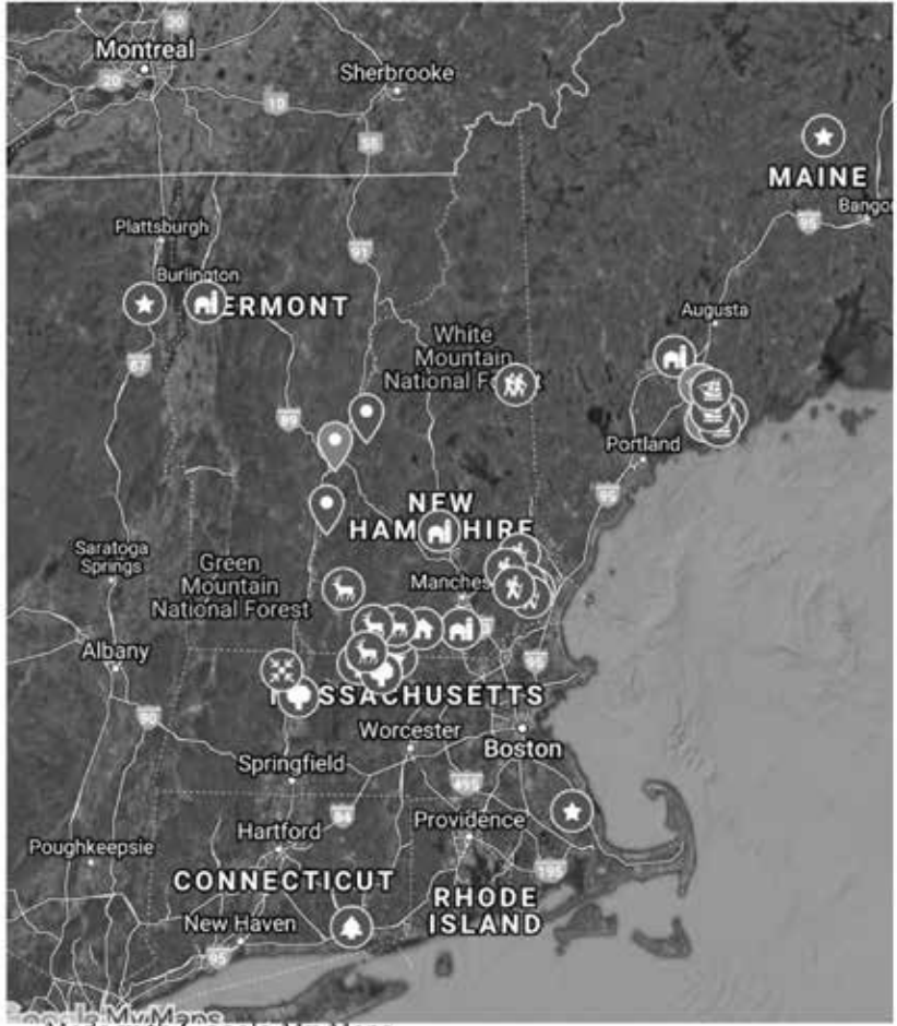
Made with Google My Maps