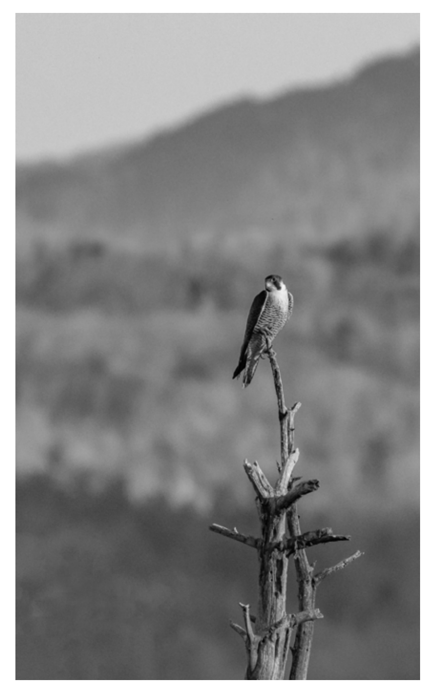
Peregrine Falcon at Eagle Mountain by Brendan Wiltse